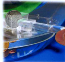
Push lever to open door!